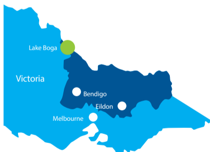
Lake Boga receives inflows from the River Murray and flood flows from the Avoca River.

During World War II it became the largest inland flying boat repair base with anything up to 1,000 air force personnel based at Lake Boga.