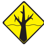
Above Water Hazard